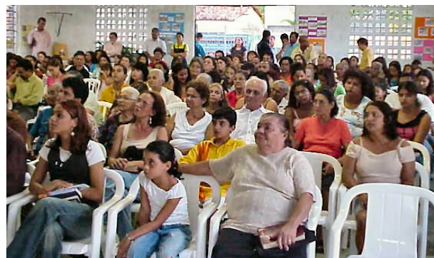
The new auditorium was filled with 187 present for the inauguration assembly that included 20 visitors.