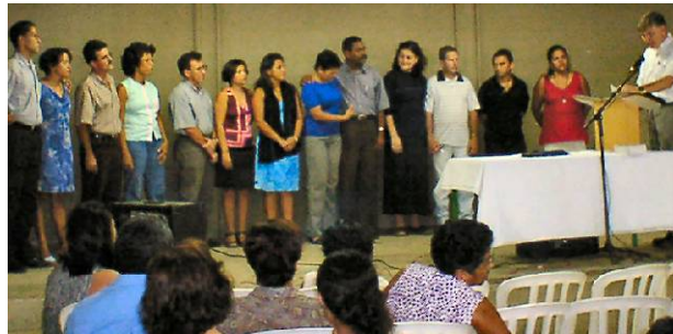
The congregation is well along the process of developing a mature leadership with elders and deacons .